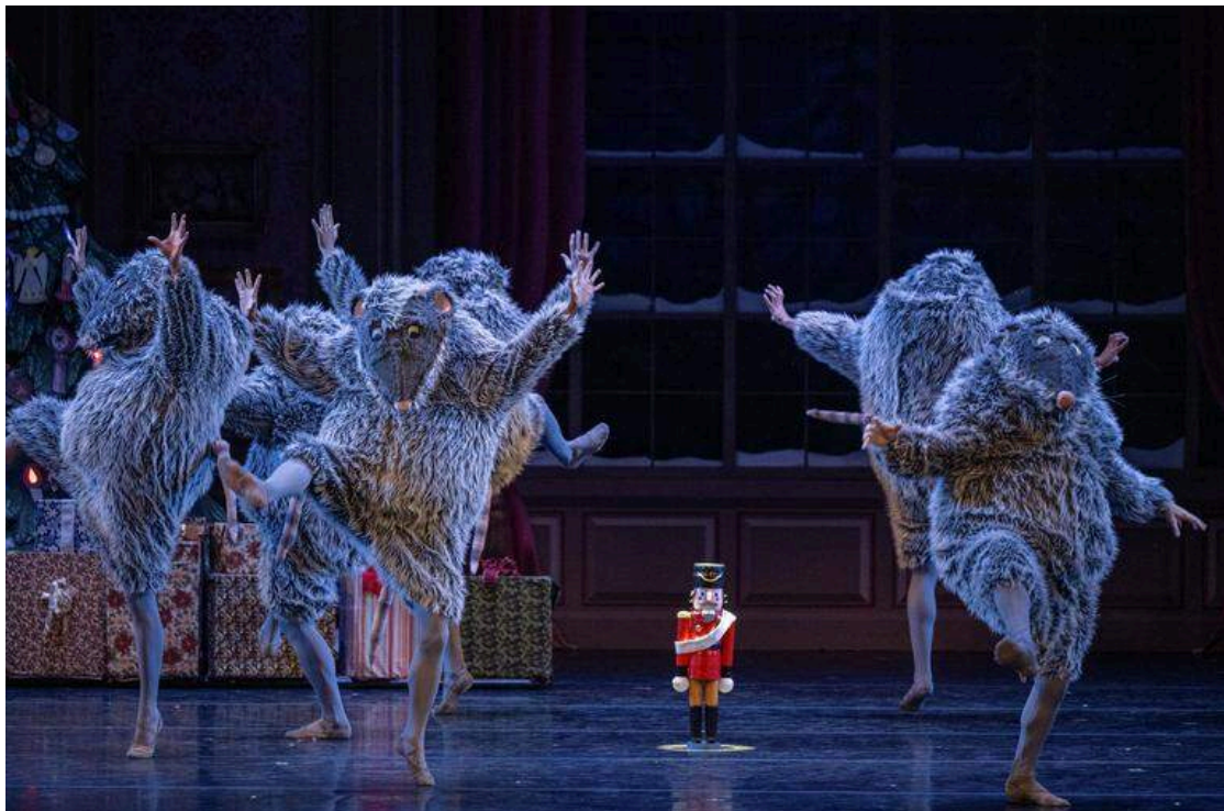
"The Nutcracker" has been a holiday staple for the Kansas City Ballet since 1972.

A Kansas City holiday tradition since 1972, "The Nutcracker" features music by Pyotr Ilyich Tchaikovsky with updated choreography by KC Ballet artistic director Devon Carney.