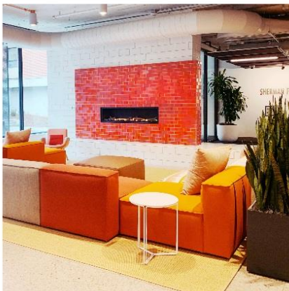
Sherman Family Student Union