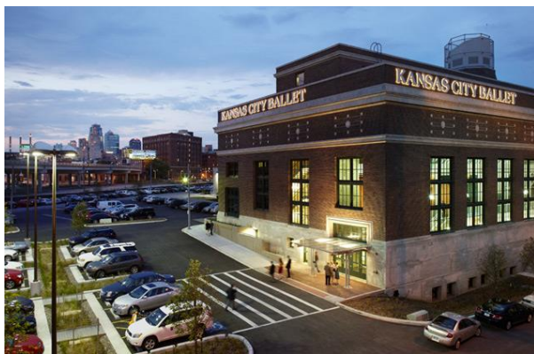
Bolender Center (Exterior)