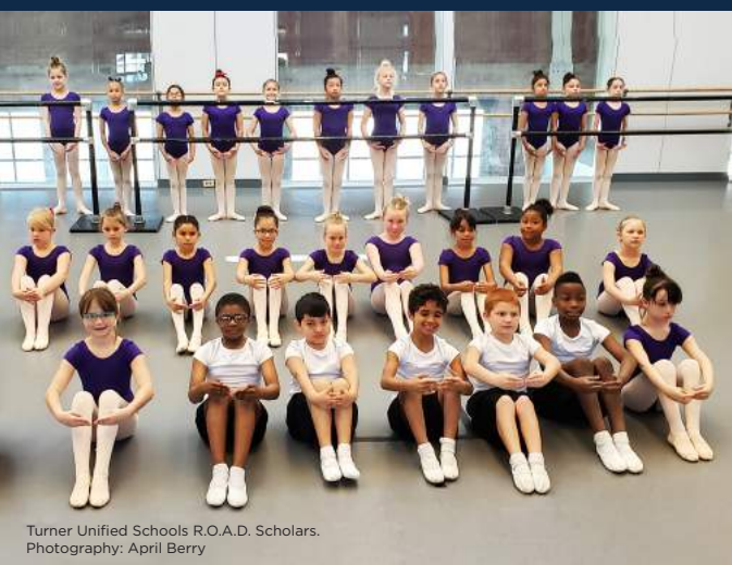
Turner Unified Schools R.O.A.D. Scholars.