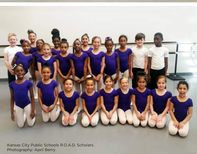
Kansas City Public Schools R.O.A.D. Scholars.

"This Program has allowed my daughter's dream to come true. She always wanted to dance and now gets a chance to do it!"