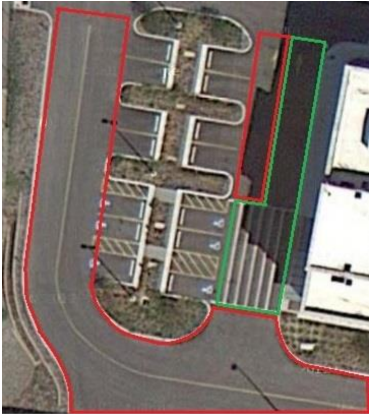
BC DROP OFF MAP

instance, please do not block the two low spots along the curb that allow vehicles to exit and enter the parking area.