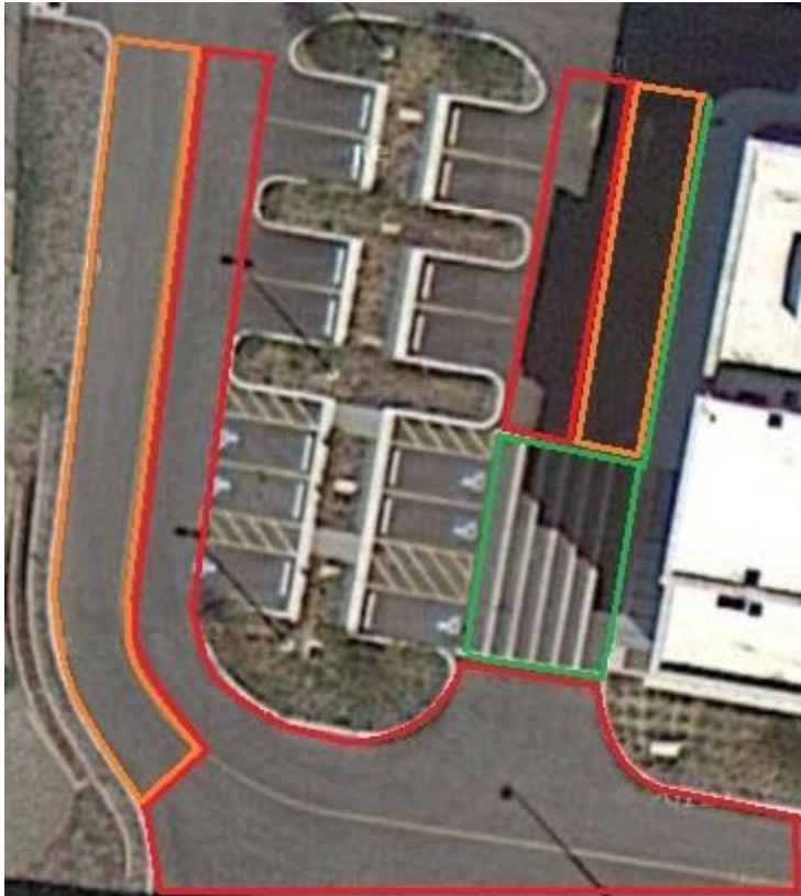
BC PICK UP MAP